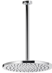
Assembled model shown for illustrative purposes