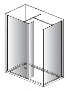
1 x Glass panel (up to 1200mm max) 1 x Glass panel (up to 1000mm max)