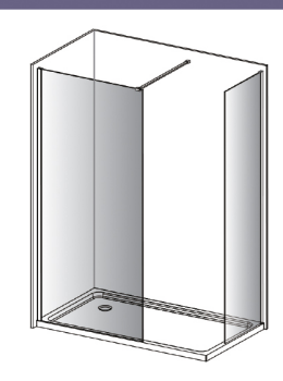
2 x Glass panel 1 x Door Package (up to 500mm max) 2 x Fixing kits