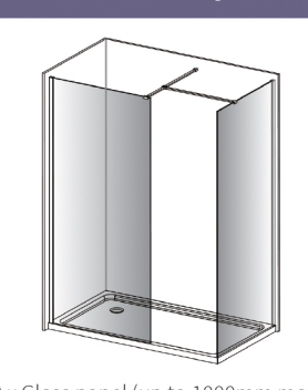
2 x Glass panel (up to 1000mm max) 2 x Fixing kits