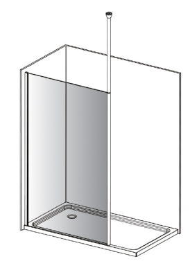
1 x Glass panel, 1 x Floor to ceiling post 1 x Fixing kit Tray must be at least 100mm up to door dimension