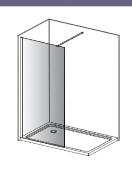
1 x Glass panel 1 x Fixing kit