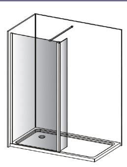
1 x Glass panel (up to 1200mm max) 1 x Fixing kit 1 x Flipper Panel