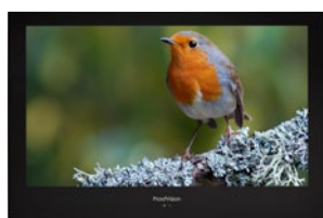
Black - PV32BF-A