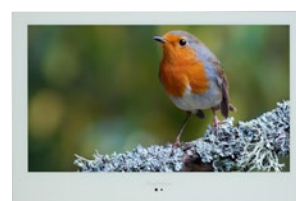
White - PV32WF-A