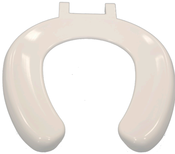
Shown: White infant crescent seat STWHSRING