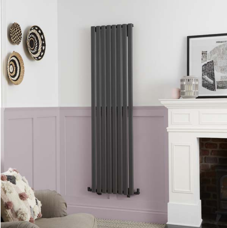
1800 x 472mm