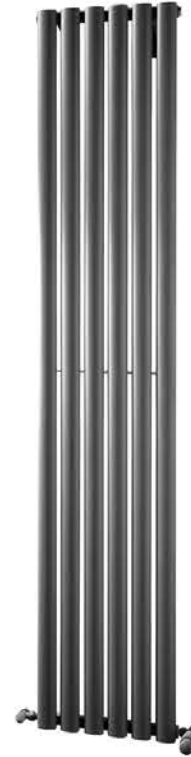
1800 x 352mm